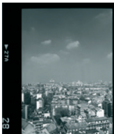
Kenko Red filter, T = 1/60 sec. f/11 . The upper sky segment begins to become darker.