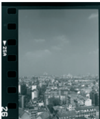
Yellow filter, T = 1/500 sec. f/11 . Slightly strength of visible of clouds.