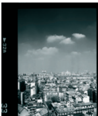
Infrarex Red filter (RG1), T = 1/8 sec. f/11 . The results are comparable with two latter IR filters.