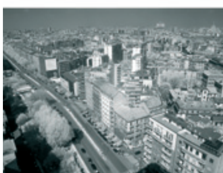
Infrarex Black filter (RG3), T= 2 sec. F/11. This filter let the IR lights pass through with an wavelength of 800nm, not usable for the IR films anymore. Nevertheless, the picture could still be done with the Cool- pix 8400.