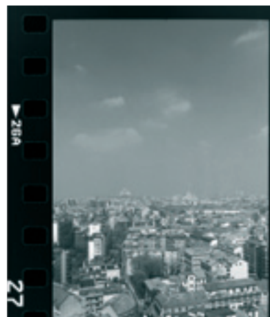
Orange-Filter, T = 1/250 sec. f/11 . The clouds are little more visible.