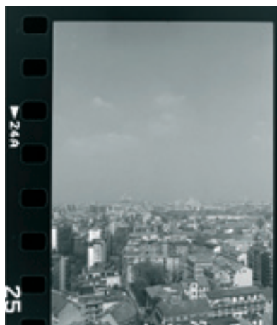
Reference image, T = 1/500 sec. f/11 .

The following pictures show different results regarding clear sky and clouds for different filters. The filters' efficiency in "penetrating" the atmospheric dust differs as well.