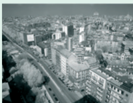
Infrarex Red filter (RG1), T= 1/15 sec. F/11.