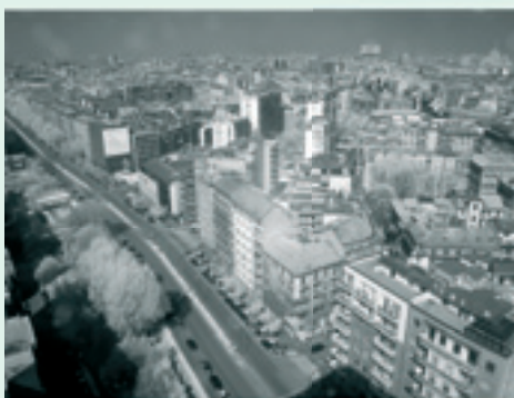
Infrarex Dark red filter (RG2), T= 1/8 sec. F/11.