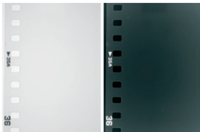
Filter Black Infrarex T= 2 sec. f/11. No image registration on the film.

(*) Kodak Wratten filter marking in clips (**) For ISO 400 film.