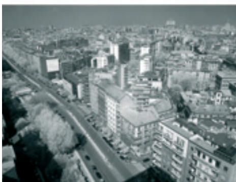
Cokin Black filter P007, T= 1/30 sec. f/11.