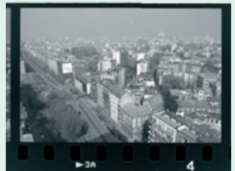
Picture without filter, T = 1/1000 sec. f/11 . the following with filtering changes.