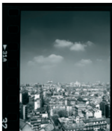
Cokin Black filter 007 (89B), T = 1/8 sec. f/11 . The result is similar to the Heliopan RG 715.