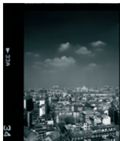
Infrarex Dark red filter (RG2), T = 1/8 sec. f/11 . The results are comparable with the three latter IR filters.