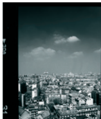
Heliopan Black filter (715), T = 1/8 sec. f/11 . The vegetation is bright, the upper part of the sky is dark. The houses on the horizon are better differentiated.