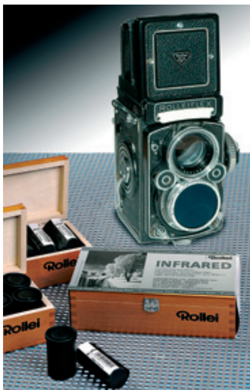
A ROLLEIFLEX 2.8 F with an original ROLLEI IR Filter mounted.

The new ROLLEI infrared film is groundbreaking. Unlike other infrared films, it does not need to be loaded or unloaded in absolute darkness. Moreover, the film can be used without classic IR filters, just like a standard panchromatic film.