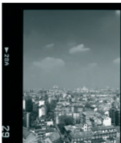
Heliopan Red filter (645), T = 1/60 sec. f/11 . Practically identically to the Kenko Red filter.