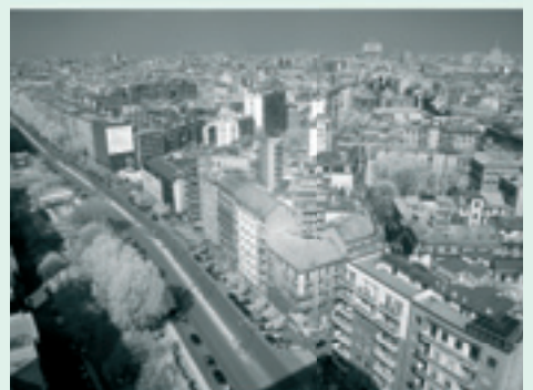
Heliopan Black filter 715, T= 1/15 sec. f/11.

Below in the series which begins with this picture, corresponds with the first picture on top taken with the Nikon Coolpix 8400, afterwards desaturated. It can be compared also an infrared admission with a digital compact camera, and on infrared film.