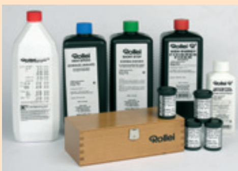
The ROLLEI Chemistry: The two developer, Low- and High Speed, short-stopping stop bath, fixing bath, wetting agent.

For the further processing, the stop bath , fixing bath and watering, the process is the same as for all conventional B&W films. Reminder, that in opposite to the former MACO Infrared Emulsions, the ROLLEI Infrared can be processed at dim light.