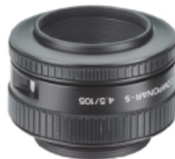
COMPONAR-S 4.5/105 iris mount BL-L

The COMPONAR-S has a useful mount with an easily grasped aperture adjustment ring which makes the lens easy to use. An illuminated aperture makes it easier to use in the darkroom. The aperture adjustment ring with a linear scale has a click-stop at each full f/stop. By simply pulling down the aperture ring, the click-stop feature can be disengaged to permit fine adjustment of the aperture. Further information about specific lens barrels can be found at the end of the brochure.